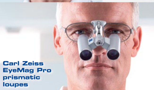
Carl Zeiss EyeMag Pro prismatic loupes