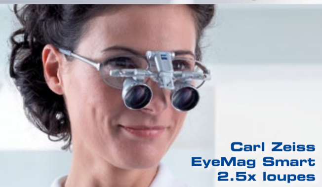
Carl Zeiss EyeMag Smart 2.5x loupes