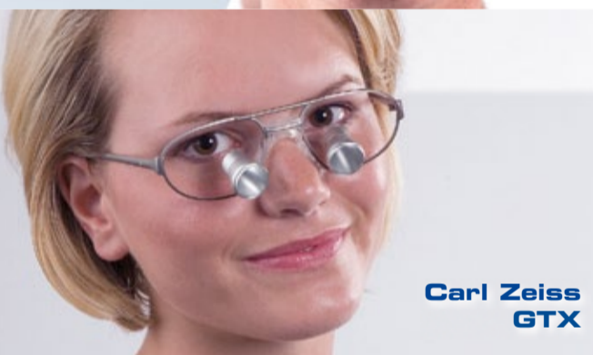
Carl Zeiss GTX